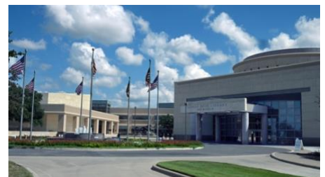
George H.W. Bush Library and Museum in College Station, TX.